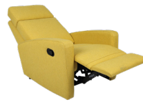
Single Love Seat