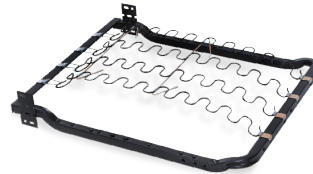
With mounting rear brackets