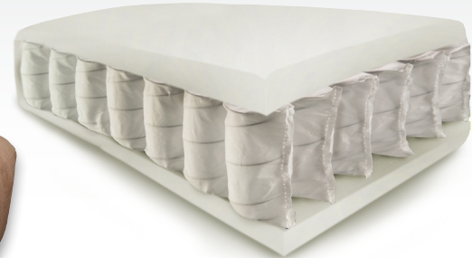
Shown with patent-pending CoilMax™ Technology